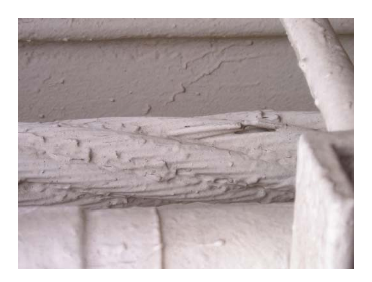
Figure 5. Fretting of suspender ropes.

Because of the lubrication effect, the fatigue life seen of the standard un-lubricated samples as received from a rope mill should not be compared directly with that of samples 1 and 2.