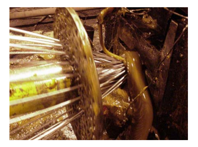
Figure 3. Application of preservative.

The coating applied to the wire for testing purposes incorporates a combination of 45% zinc dust and 45% zinc oxide in a blend of vegetable oil, with additional corrosion inhibitors. These types of corrosion inhibitors can increase the life of the cable substantially by protecting the wires as a sacrificial anode as well as repel water away from the surface. They must remain flexible during the life of the cable to adjust and deflect as the cable operates. Grease type corrosion inhibitive treatments can be used to prevent moisture from entering the cable and provide reduced friction between the wires during its operating life. The main drawback to these types of treatments is the appearance of the material on the exterior of the strand. Figure 3 shows the application of Syncan Grease preservative, supplied by the Grignard Company LLC, to galvanized structural strand during the manufacturing of the cable.