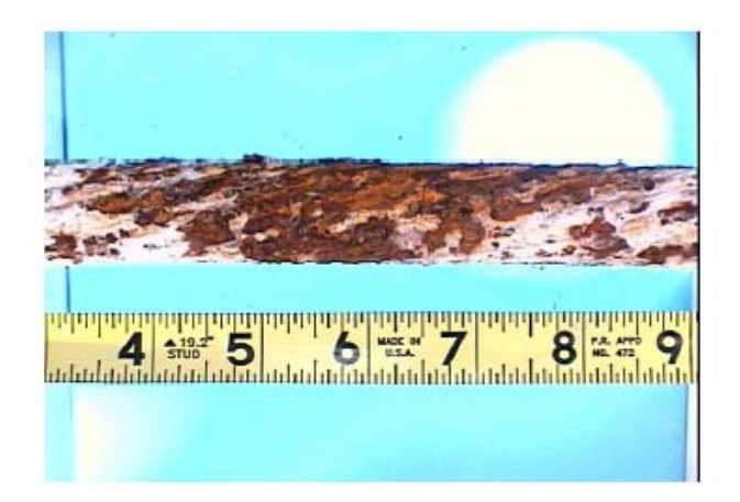
Figure 1. Corrosion of bare wire.

Aside from the zinc coating applied to the wire surface there are numerous additional types of coatings that may be applied to the rope or strand to increase the corrosion resistance of the assembly. Studies have been performed to find alternatives to painting or coating the cables onsite after installation. Greases, pastes, and preservatives applied internally to the cable during the manufacturing process work to protect the wires from corrosion during the life of the cable. Testing done by the State of California Department of Transportation compared wires coated with Gri-Kote Z-Complex 2C, manufactured by Grignard Company LLC, bare wires, and various other coatings after 6 months of accelerated corrosion testing in an ASTM B117 salt fog chamber. The obvious signs of severe corrosion are present in Figure 1 of the bare wire while oxidation of the wires in Figure 2 is the result of the wires coated with Gri-Kote Z-Complex 2C.