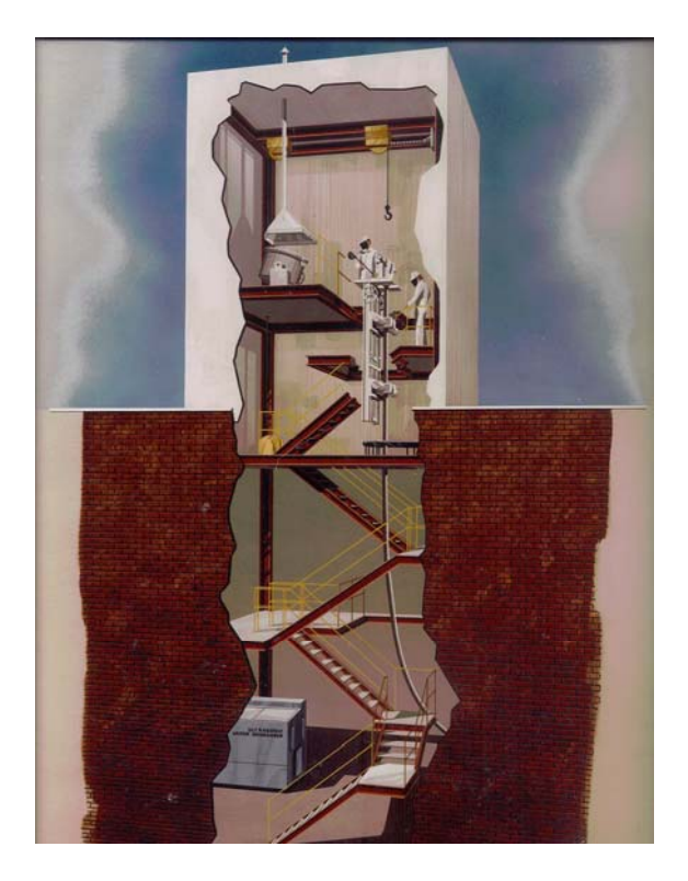
Figure 4. Socketing tower

The broomed end is then closed and inserted into the socket splaying the wires evenly to allow flow of the socketing medium around each wire. The axial alignment of the socket with the strand should be checked. In addition, the concentricity of the strand within the socket should be checked. Proper socket alignment assures maximum service life for any socketed assembly, by distributing stresses to all wires in the strand in equal proportion. The socketing medium is then added to the socket. The two common types of medium are resin and zinc. With each having positives and negatives to the installation and long term assembly the zinc medium is the most common found today. Several other mediums including Zinc-Aluminum and Zinc-Copper are becoming present on the market. The final operation of the socket attachment process is proofloading the socket. The proofloading of the socket serves to test the pouring operation of the assembly manufacturer. It also serves to seat the socket. Spelter sockets work on a wedge action to develop the strength of the socket. The wedging seats the cone in the socket causing some elongation of the assembly. This elongation should be accounted for in the layout of the assembly.